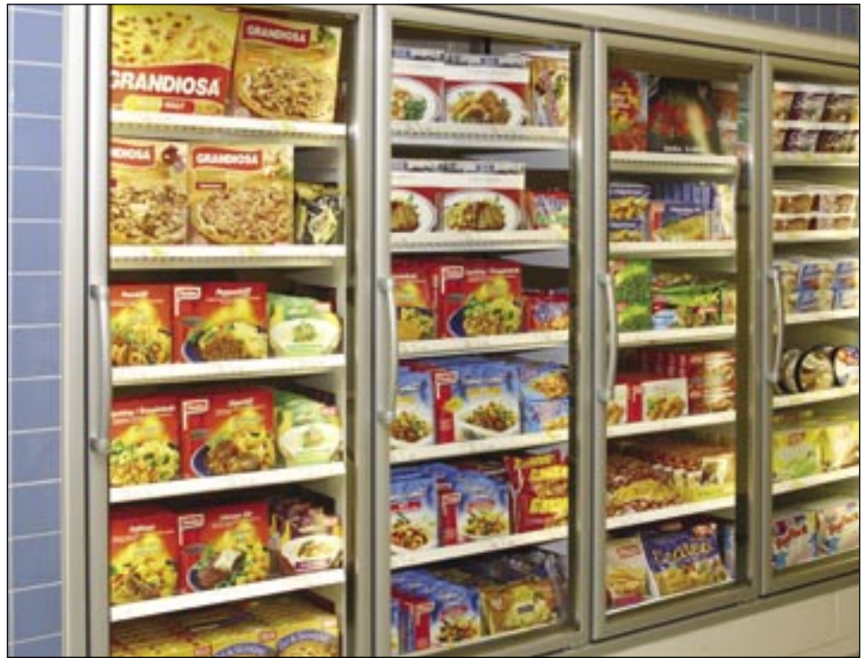
T66 LT, OK/Q8 Huddinge. Optimal visibility increases sales.

There are many application areas for our glass doors; for example, storage of blood bags in a blood bank.