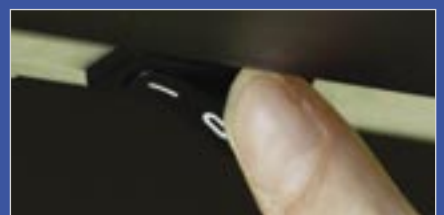
Frame heating can be switched on and off manually.