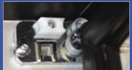
To facilitate stocking and cleaning, the doors are equipped with doorstops.