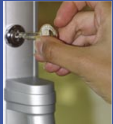
Doors can be equipped with locks.