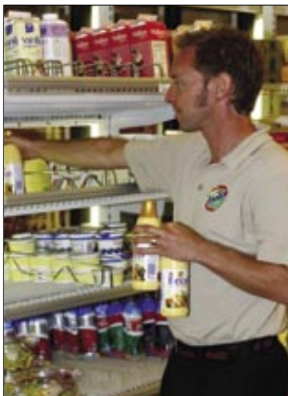
Stocking and cleaning – fast and easy when the shelves are front-mounted.