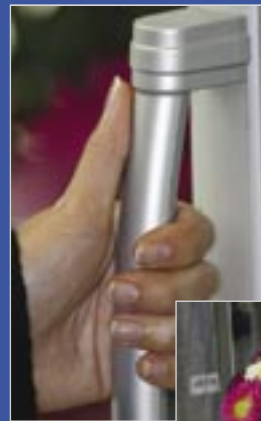
Elegant and sturdy handle design.