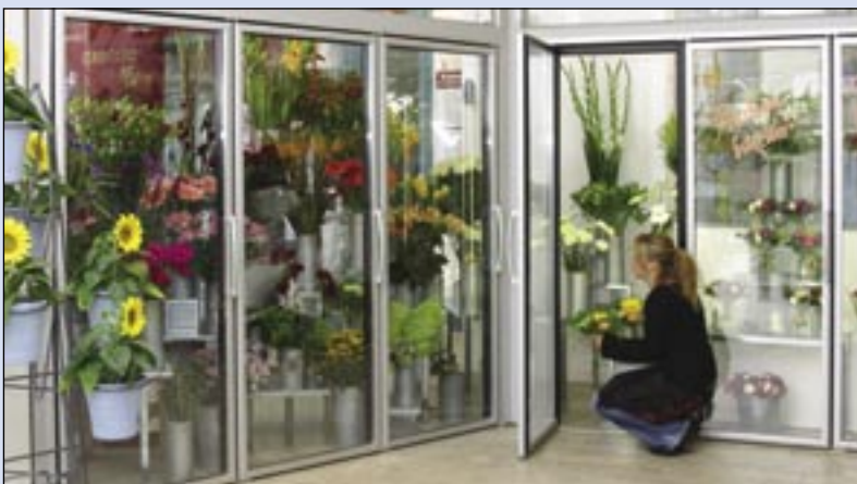
Roll In doors mounted on a chilled flower display unit, where attractive lighting shows the flowers at their best.

Roll In doors are practical for smaller cold rooms behind which there are no storage areas.