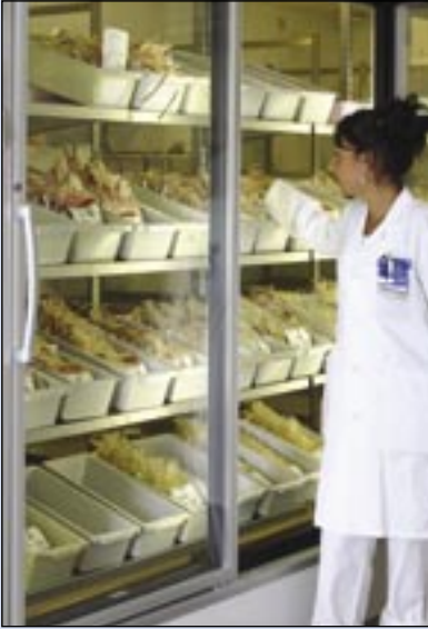
T76 NT, blood bank, Huddinge Hospital. Our glass doors meet the highest demands on quality.

There are many application areas for our glass doors; for example, storage of blood bags in a blood bank.