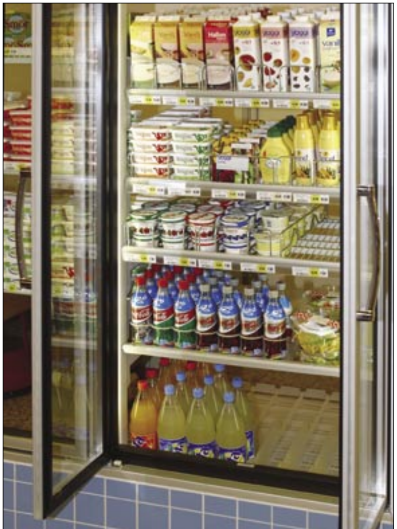
Regardless of size, all goods fit in our flexible shelving system.