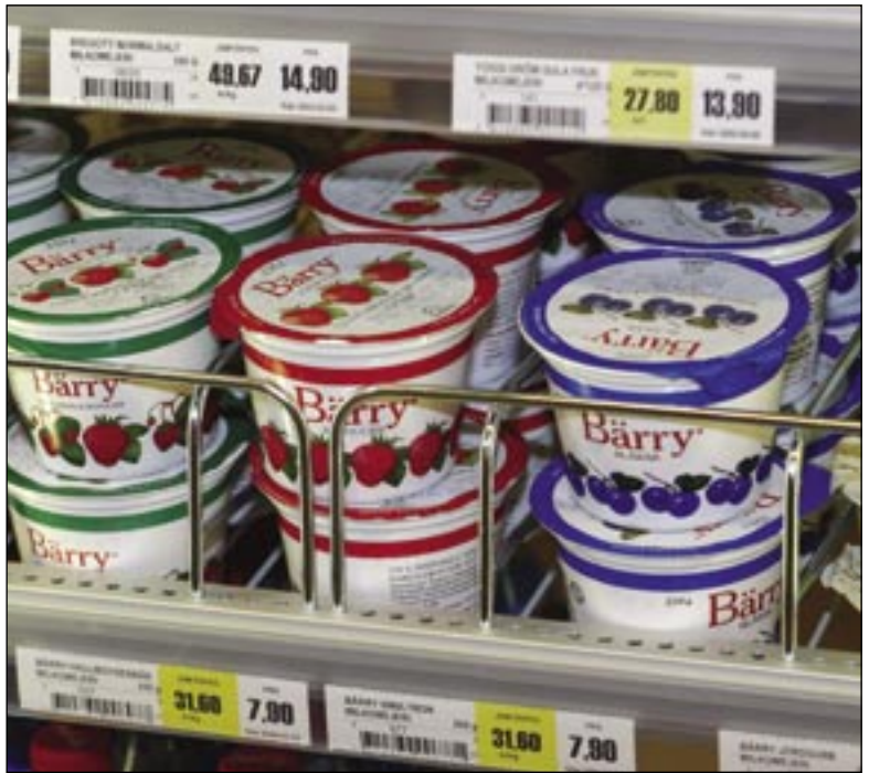
One good reason to choose Flexi Shelf Pro is that all the components are easy to adapt for all types of goods.

The shelving system has only two uprights, which are mounted at the front. This makes it easier to clean and rearrange the shelves.