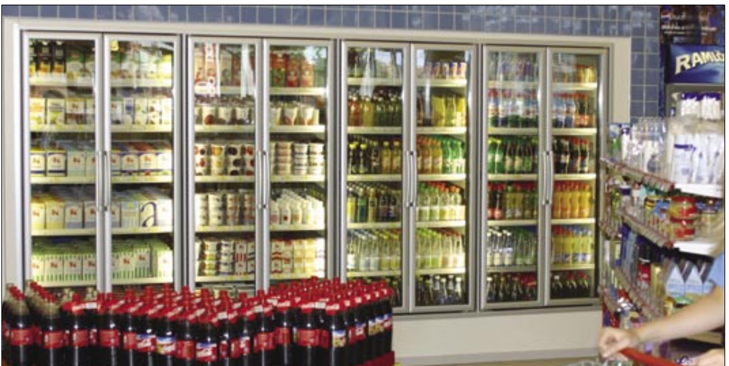
T45 NT Maxi Twin. Ideal cold display doors for smaller shops.

radius in front of the display, which is a definite advantage in small shops such as convenience stores and petrol stations. Maxi Twin is module-adapted for 45 cm dairy containers, which simplifies handling.