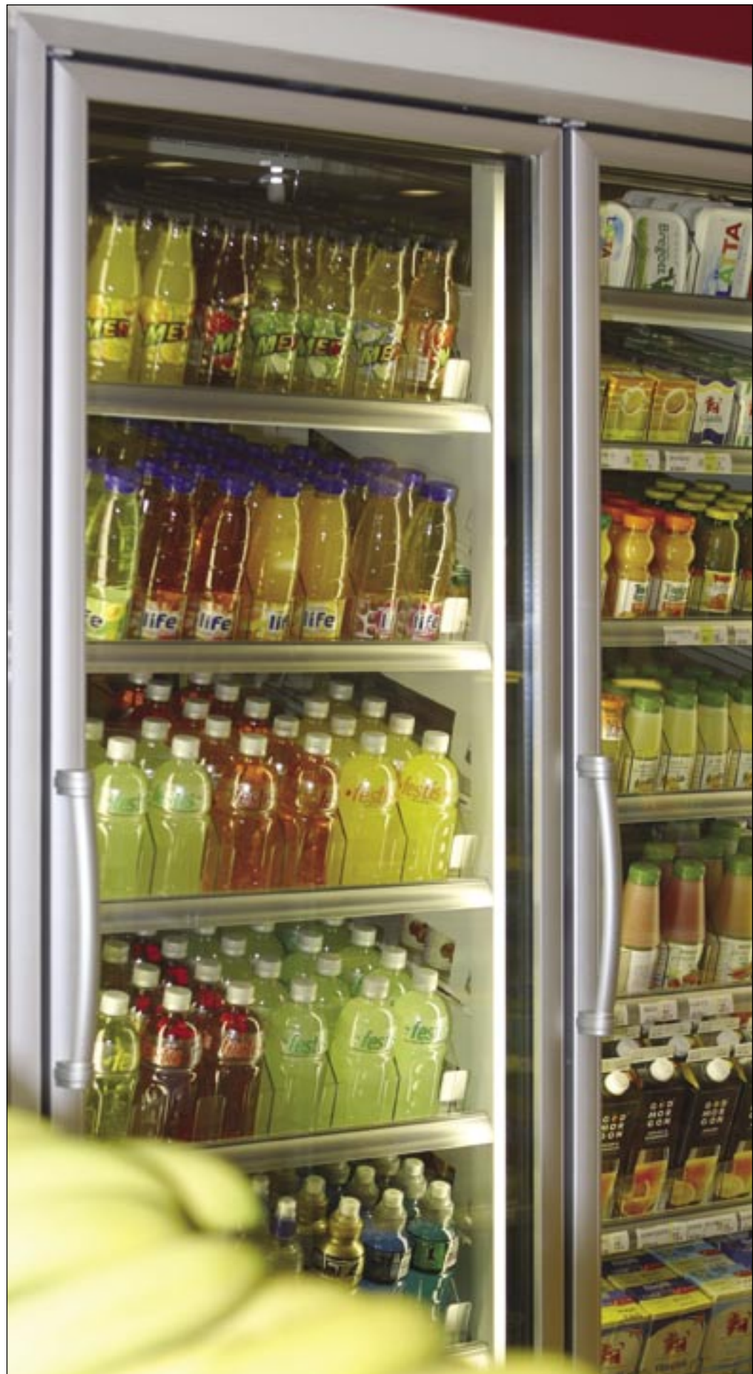
T66 NT, 7-Eleven, Arlanda. Elegant, energy-efficient and effective display with self-closing doors.

NT = Normal Temperature, cold display, down to +2°C LT = Low Temperature, freezer display, down to -25°C